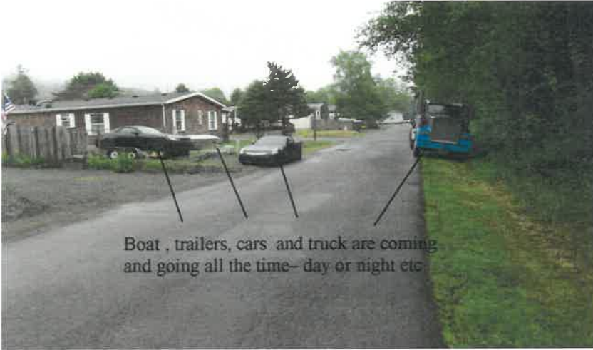
Boat , trailers, cars and truck are coming and going all the time- day or night etc

Pictures do not include occurrences of power and or water lines across the road while the vehicles are being worked on. Cars are LOUD and are being worked on all hours of day or night... and much of the time the log truck's tires are on Lake Blvd.