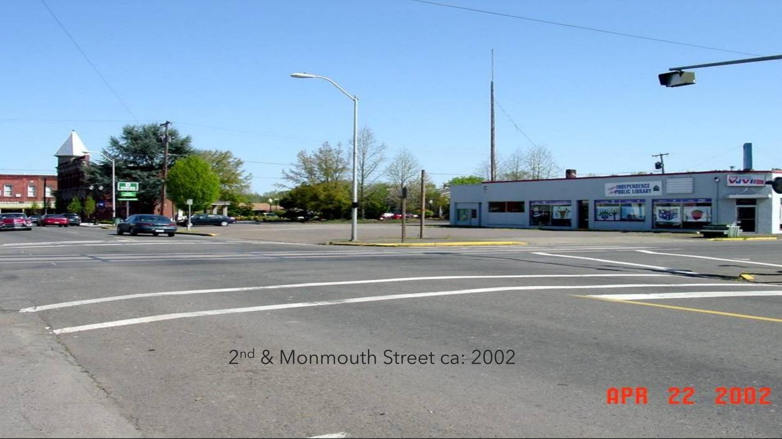
2 nd & Monmouth Street ca: 2002