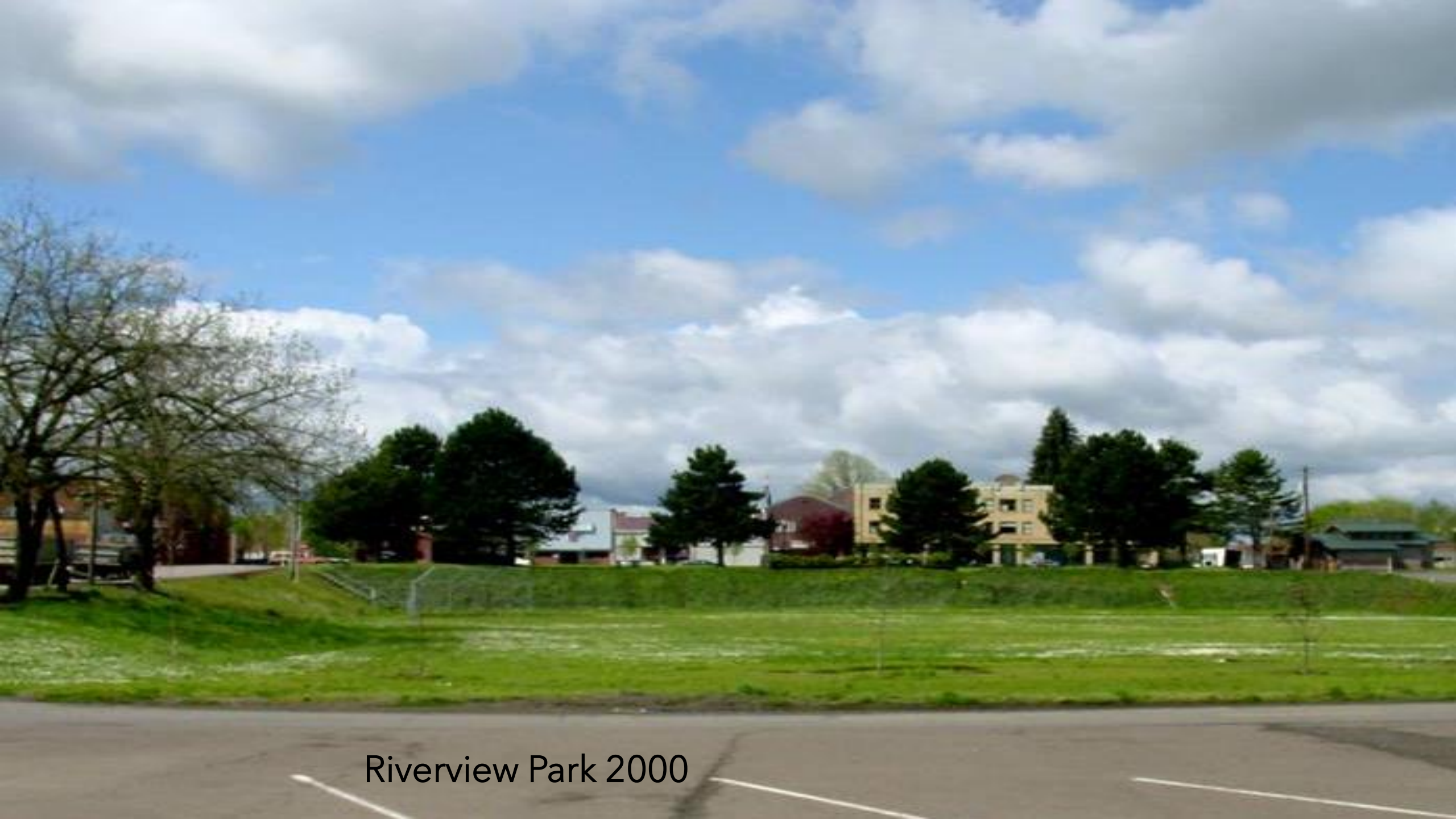
Riverview Park 2000