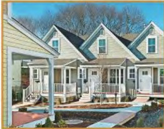
COTTAGE COURT SEE MORE HOME TYPES INSIDE!