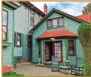
ACCESSORY DWELLING UNIT