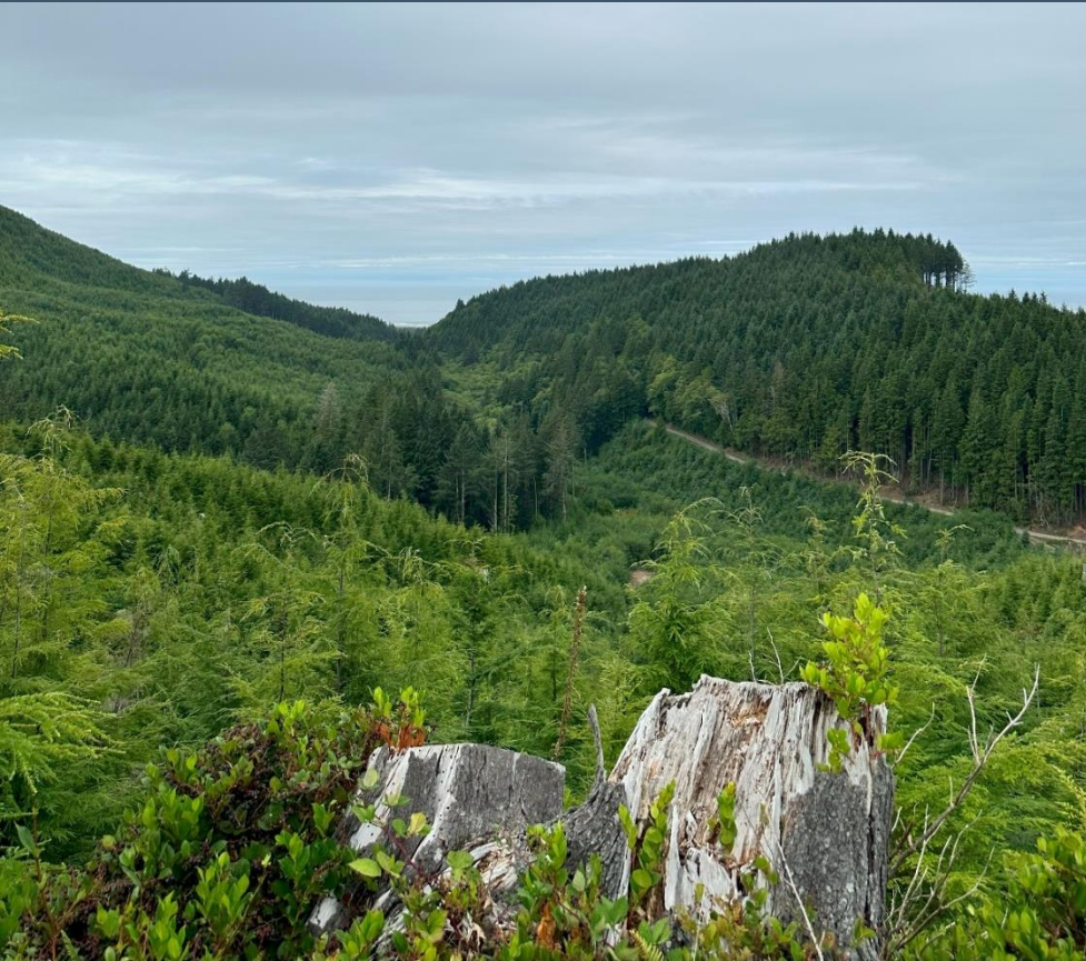
September 2023 Site Visit: Jetty Creek Working Group