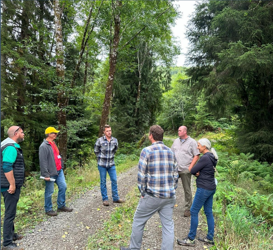
September 2023 Site Visit: Jetty Creek Working Group

Proposed LOI for approval between Nuveen Natural Capital and City of Rockaway Beach – Resolution 2024-32