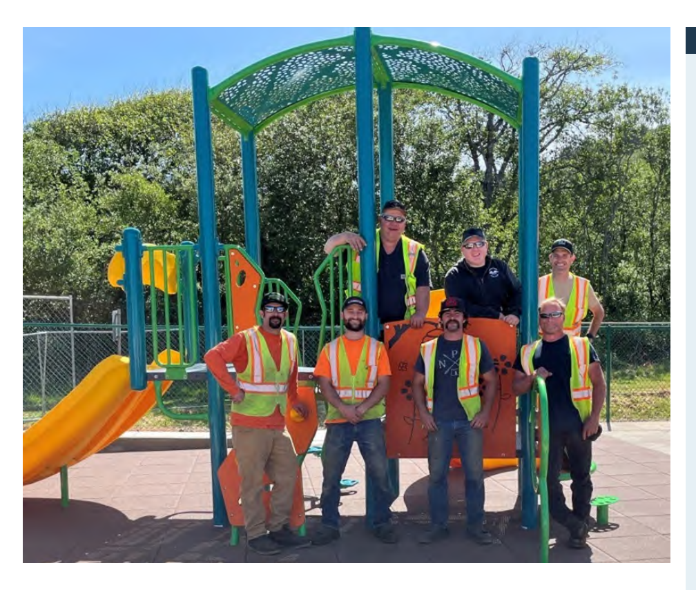
Public Works staff with the new Anchor Street Playground