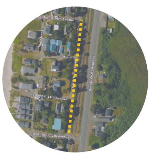
N MILLER NW 13<sup>th</sup> - NW16<sup>th</sup>