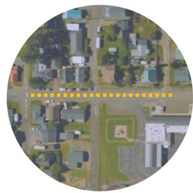
N 3<sup>rd</sup> N Dolphin - N Falcon