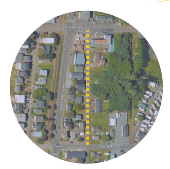
ANCHOR S 3<sup>rd</sup> - S 4<sup>th</sup>